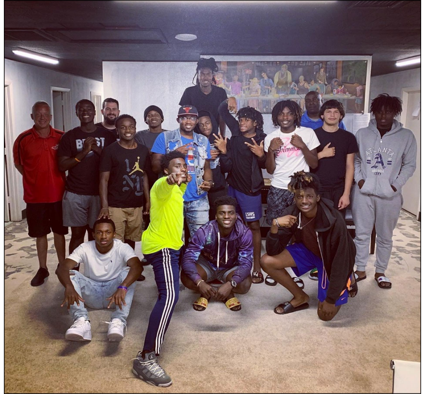
The Lee County Sheriff Office teamed up with Pickup the Ball, Inc. to engage local youth in hard discussions, reverse role-play, social and sporting event, as well as one-on-one discussions and training.