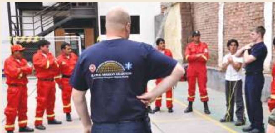
Caraz fire fighters learn shore-based water rescue basics before getting in the water.

Working in close partnership with the PFFM, Local 785 began lobbying in the state capital to create and pass LD 1558. Their efforts garnered bi-partisan support. In fact, the bill passed unanimously out of the state legislature’s Joint Standing Committee on Labor before passing unanimously in the house and by significant majority in the senate. ■