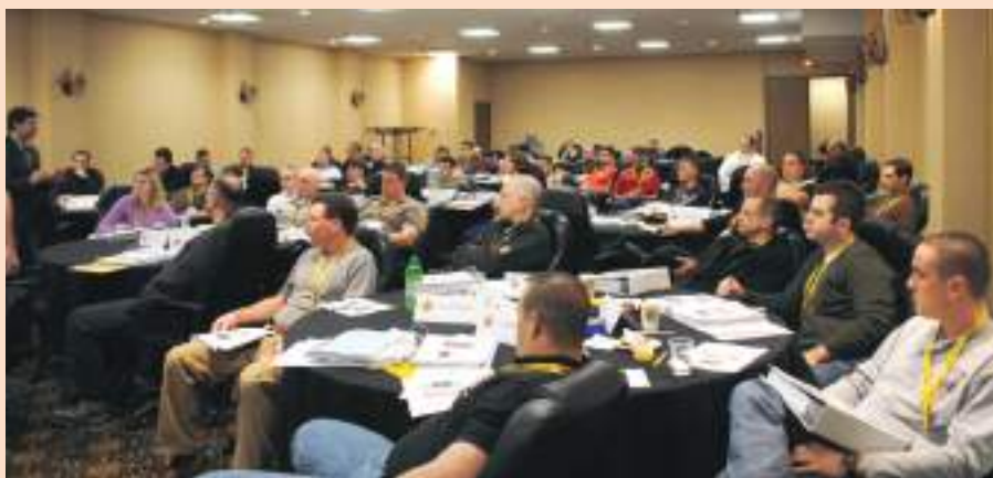
Participants in the week-long Political Training Academy emerge with the political knowledge and skills needed to run for public office and run effective political campaigns.

The online application process is open from Labor Day through early November each year. For more information, visit the IAFF web site or contact the IAFF Political Action Department at (202) 824-1582. ■