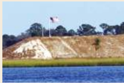
A flag commemorating fire fighters lost on 9/11 flies on Hill 343.

Hill 343 is visible from Atlantic Boulevard driving over the Intercoastal Waterway in Jacksonville. ■