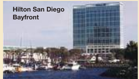
Hilton San Diego Bayfront

San Diego Local 145 is the host local and will sponsor the welcome reception and