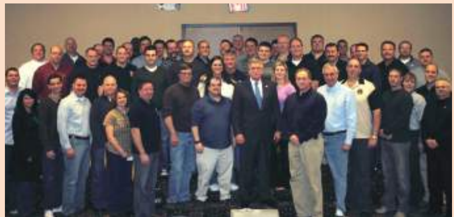
These IAFF members from throughout the United States and Canada represent the class of 2010 at the IAFF Political Training Academy.

the classroom presentations - participants also took part in two mock campaign exercises: a mock press conference exercise where members practiced their public speaking skills in front of a camera and a campaign plan and budget for a mock