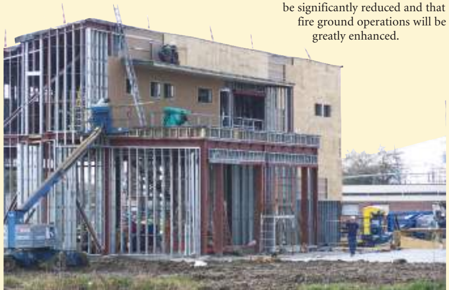
St. Bernard Parish Station 6, which is under post-Katrina reconstruction, will be staffed with fire fighters funded by a $875,570 SAFER grant.