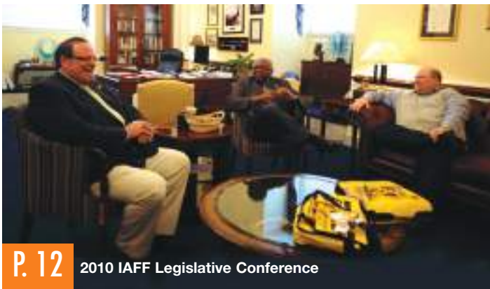
P. 12 2010 IAFF Legislative Conference

Federal grants put fire fighters back on the job .....16