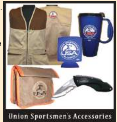
Union Sportsmen's Accessories

Check it all out at www.promoplace.com/27984/stores/union-sportsmen and watch for the new lineup of T-shirts, sweatshirts and other outdoor accessories coming later this spring. Gear up and get outside! ■