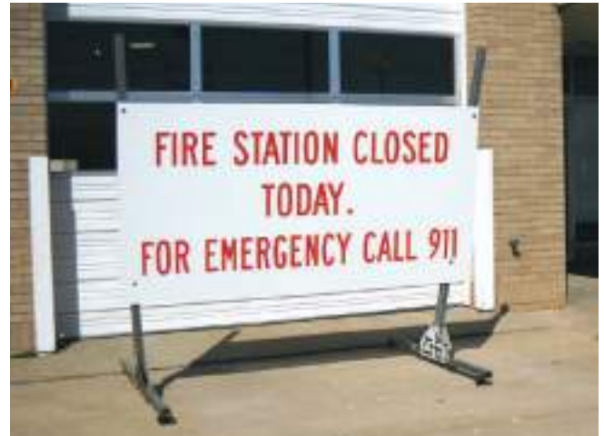
P. 16 A SAFER grant will help Springfield, Missouri, re-open fire stations closed due to budget shortfalls.