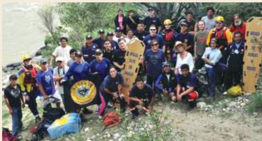
Participants celebrate their rescue training success with a group picture.