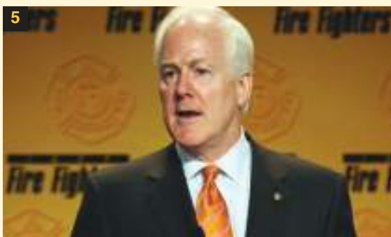
Also speaking at the 2010 Legislative Conference (from top left) were (1) Representative Betty Sutton (D-OH), (2) Representative Kendrick Meek (D-FL), (3) U.S. Secretary of Labor Hilda Solis, (4) Senator Sherrod Brown (D-OH), and (5) Senator John Cornyn (R-TX).